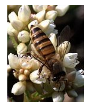
Apis cerana<sup>2</sup>

being smaller than A mellifera the hives are a smaller version of the Langstroth hive. Similar to A mellifera , there are several subspecies adapted to different environments: