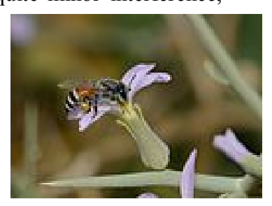
Apis florea Photo: Gideon Pisanty.<sup>1</sup>

readily tolerated by A mellifera , can induce it to desert. A florea builds the comb on the branch of a tree or shrub. Unlike A mellifera , the returning foragers do not recruit foragers by the waggle dance on the vertical face of the comb. Instead, they perform the dance on the horizontal upper surface where the comb wraps around the supporting branch. The dance is a straight run pointing directly to the source of pollen or nectar. In all other Apis species, the comb on which foragers dance is vertical, and the dance is not actually directed towards the food source.